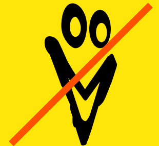
STRETCH / SQUEEZE